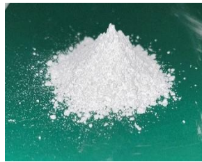
(1) New negative thermal expansion powder (ZMP)