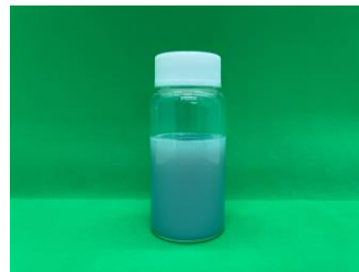
Highly transparent antibacterial & antiviral coating solution