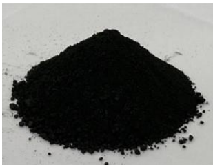
(2) Black powder for near-infrared transmissive films