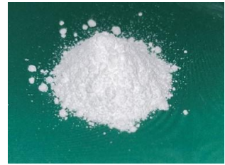
(1) New negative thermal expansion powder (ZSP)