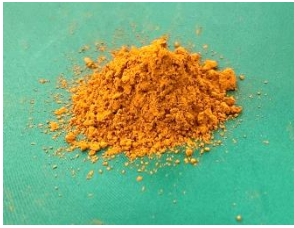
(1) New negative thermal expansion powder (CZVPO)