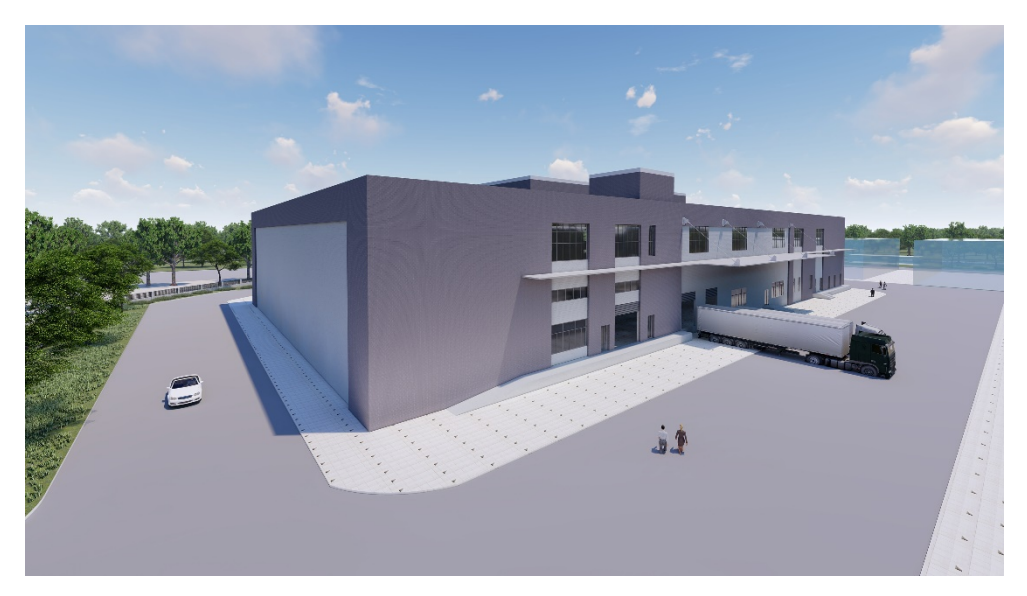
Production Building Completion

[Production base in Mitsui Kinzoku Catalysts Zhuhai Co., Ltd.]