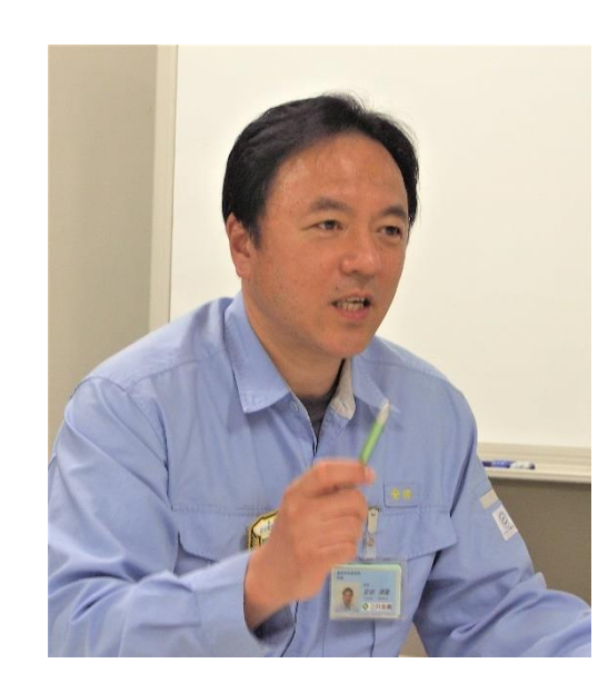
Executive Officer, Senior General Manager of Business Creation Sector

The department is already playing this critical role in our new themes: solid electrolyte for all-solid-state batteries (ASSBs) and special glass carrier for next-gen semiconductor chip mounting HRDP ®.