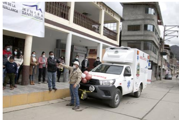
Provision of relief supplies (an ambulance) to Huallanca village

Compania Minera Santa Luisa that operates the Huanzala Mine and the Pallca Mine places importance on the engagement with the local communities around the mines, and is continuing to address the needs of the communities, such as by developing infrastructure, providing educational aid, and offering support for agriculture and livestock. In FY2021, the company donated an ambulance, medical oxygen generators and other items to support local communities affected by COVID-19.