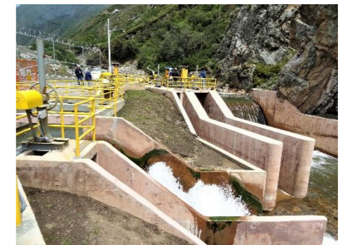
Water intake of the hydroelectric power plant (near the Pallca Mine)