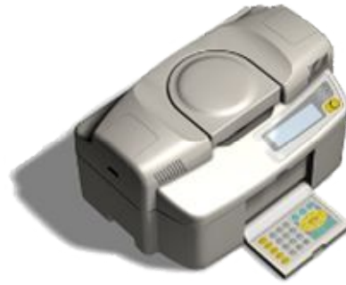
Desktop device for measuring sugar content