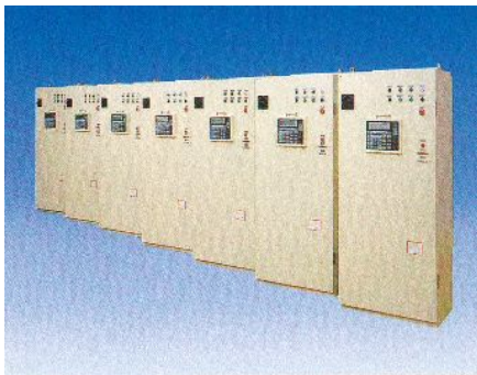
Control panel for assembly robot