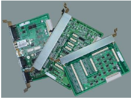
Image- and signal-processing boards and high-speed communications board