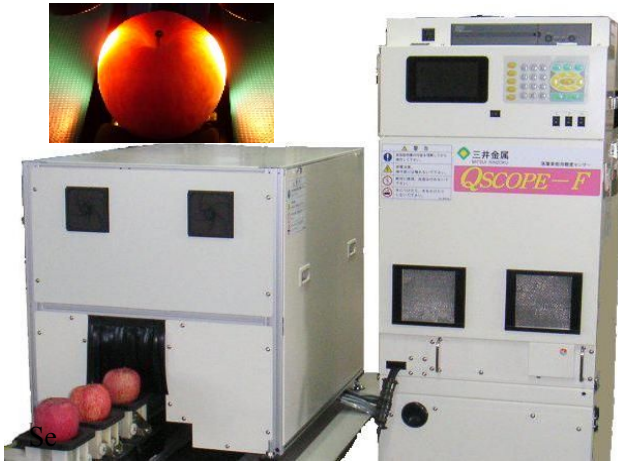
Sensor for the nondestructive measurement of the internal quality of fruits and vegetables (Qscope-F)