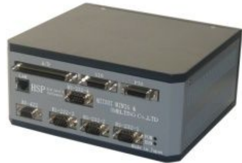
Instrumentation control unit (HSP)